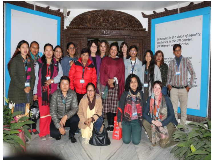
Group Picture with UN Special Rapporteur

Mitini Nepal hosted a Consultation with the UN Special Rapporteur on violence against LBT women on the 28 th of November at UN Women Conference Hall. During this Consultation LBT Women had highlighted the violence which they get from family, society and Nation. MN also shared the laws that were lacking and the provisions that should be implementation and moreover give some recommendation to UN Special Rapporteur. The recommendations could be included in the Special Rapporteur report that she will present to the UN Human Rights Council in June 2019.