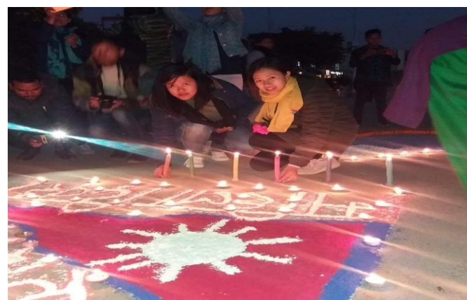
Lightning Pride Color Candle at Jawalkhel, Lalitpur

Every Year, We celebrate 30 th November as South Asian Women's Day. South Asian Women's Day is a day in which we come together and raise our voice for peace, justice, human rights & democracy. We also Celebrate this day by lightning Pride Color candle on the remembrance of the LBT women who have passed away.