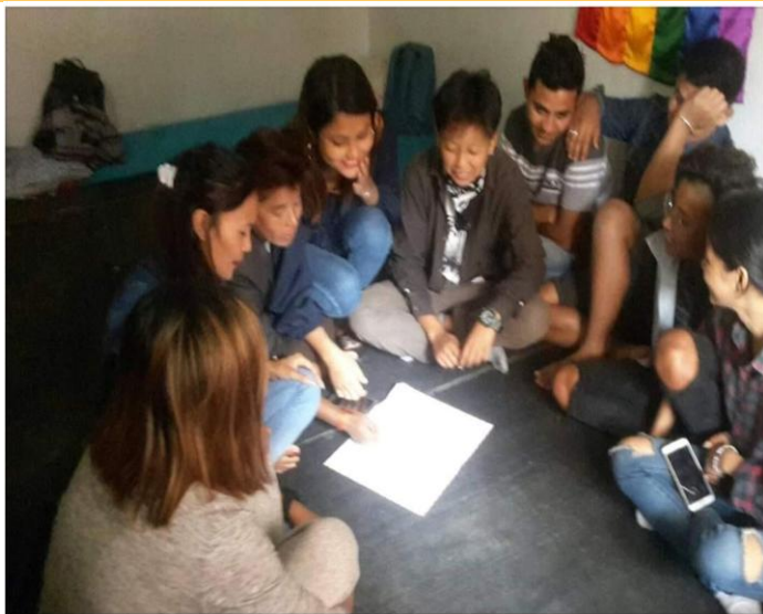
Social & Advocacy group of Sunsari

Social and Advocacy group is a network of Lesbian, Bisexual women and Transgender individuals in Kathmandu, Jhapa, dang and Sunsari. The focal persons of social and advocacy groups had their monthly group meeting (Wellness Circle) of LBT group, where they discuss and interact about the challenges. Opportunities, threats and issues of LBT community. In this monthly meeting, they discuss about the 16days of activism and Violence against LBT women. Also they planned to participate in a workshop done by other CSOs to help spread the issue of Violence faced by LBT women under the 16 Days of Activism.