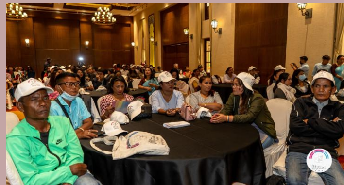
“Provincial Elders Embrace Diversity and Listen with Compassion at IDAHOTB 2023 Event”